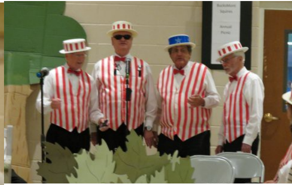
Fickle Four Quartet