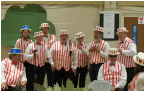
VLQ (mostly Vintage Four + Under Construction)